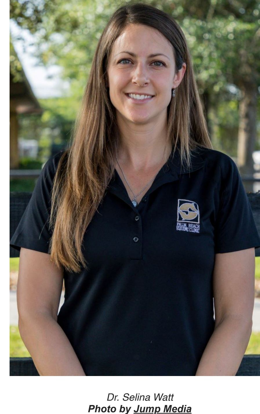
The biggest influence in my life is my mom. She has taught me too many

of the dogs got into a scrap with another dog. He was cut up so I took the first aid kit and doctored his wounds. That's when I decided becoming a veterinarian was the way to go. I called my mom the same night and told her, and she was more than a little relieved.